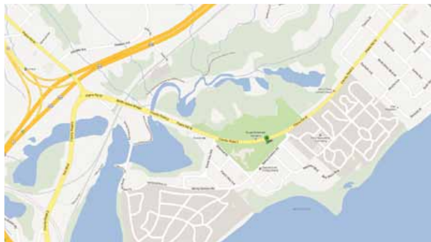
The Royal Botanical Gardens Centre is located at 680 Plains Road West, on the border of Burlington and Hamilton in Ontario, Canada.